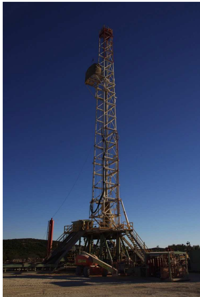
Figure 1 – Rig on Location